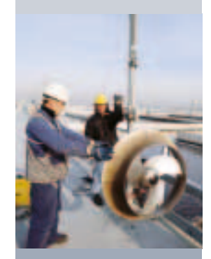
Our comprehensive mixing portfolio

Xylem's wide array of reliable, trouble-free mixing equipment includes;