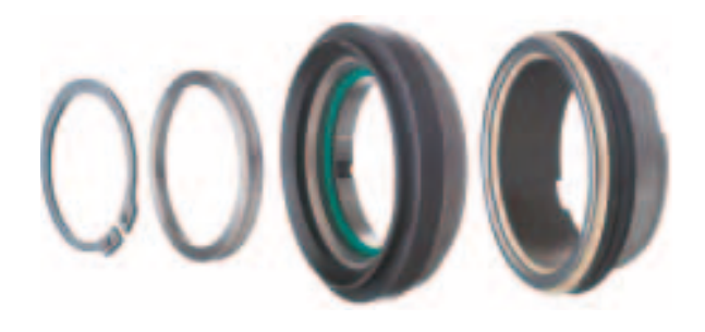
Unique mechanical shaft seal demonstrates superior sliding properties and exceptional mechanical strength.