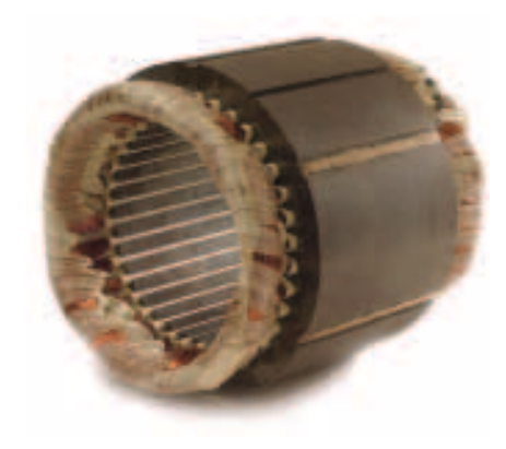
Stator windings are rated at Class H for exceptional resistance to overheating.