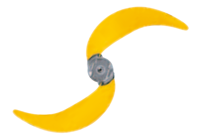
The Flygt banana blade propeller creates maximum thrust using minimal power.

A vital component for reliable operation, Flygt mechanical shaft seals feature a unique design with an intermediate barrier fluid. Made of corrosionresistant tungsten carbide (WCCR), our specially manufactured seals provide exceptional mechanical strength and superior sliding properties. This results in significantly less wear between the seal surfaces. It also reduces the risk of leakage and prolongs seal service life.