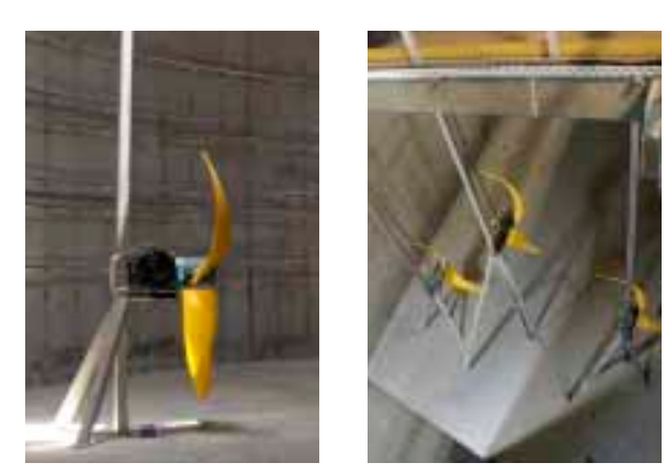
The guide bar system makes mixers easily accessible.

Raising and lowering Flygt low-speed mixers with our lifting equipment is as easy and convenient as it is safe. The CE-approved lifting davit is mounted in a holder at its lower end which enables easy turning of the davit. To reduce investment cost, one davit can be used wfor several mixers.